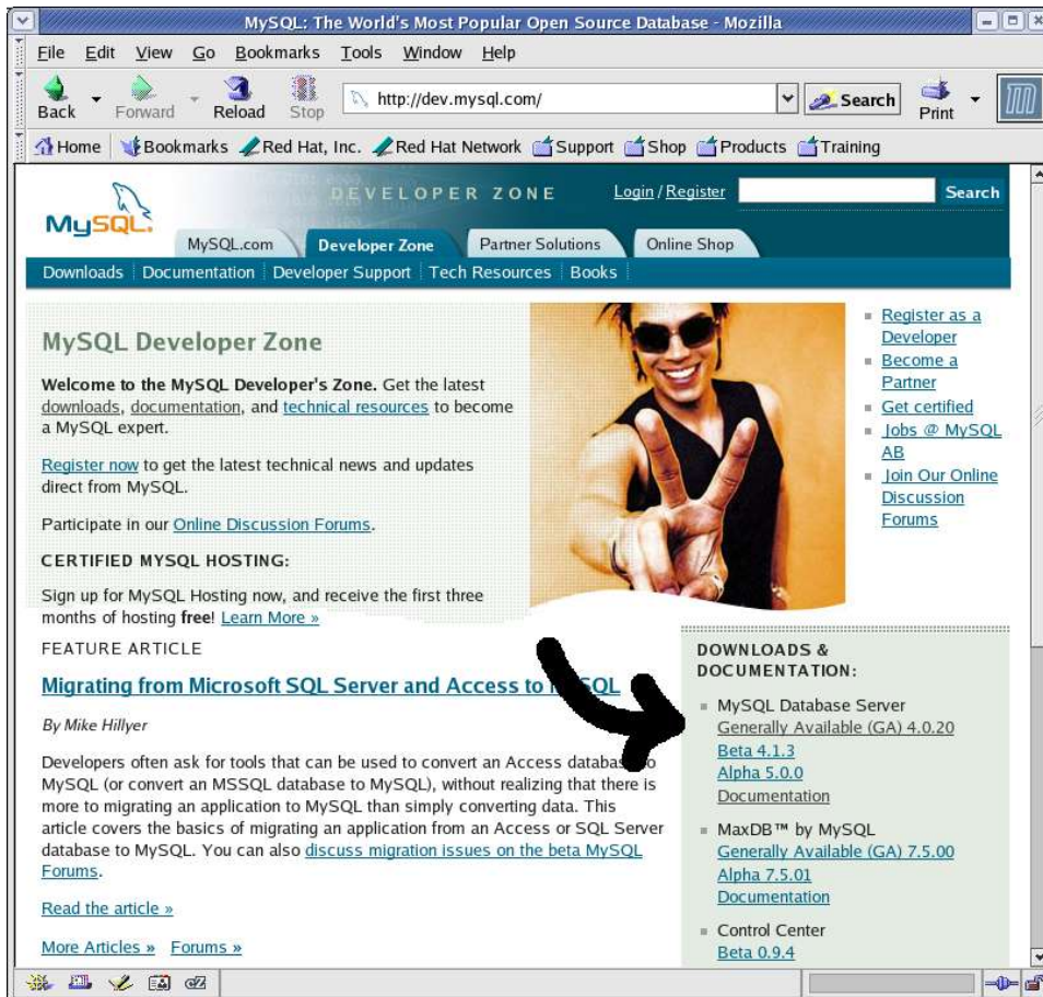
Figure 2. The Generally Available (GA) link is where the most current version of MySQL is located.

Click on the link to get to the listing of downloads. Scroll down to the Linux x86 RPM downloads section, and download both the Server (9.8 MB) and Client programs (2.6 MB) files, as shown in Figure 3 .